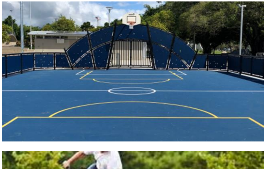
Figure 4 – Indicative Images for Master Plan