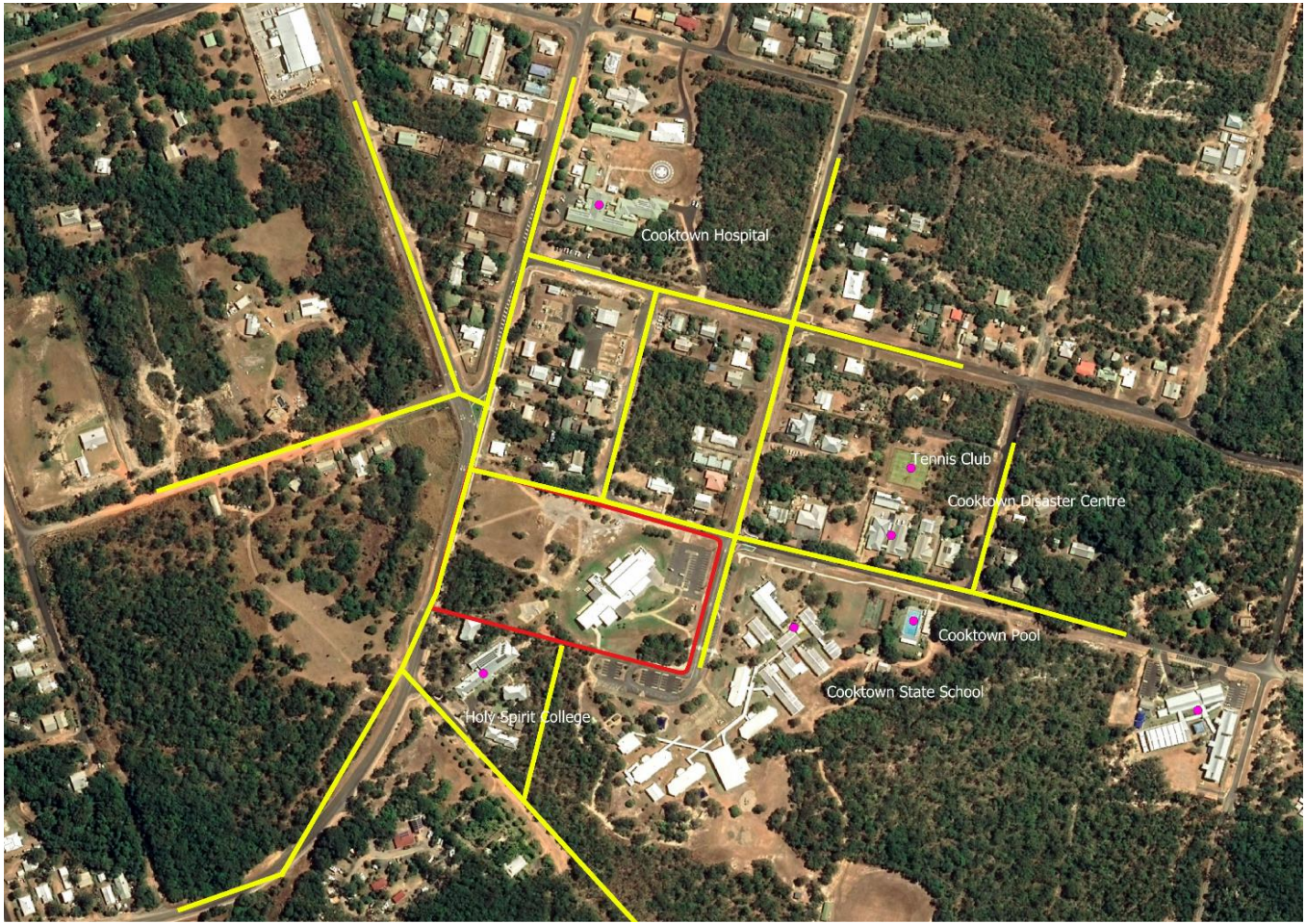
Figure 3: Nearby Facilities within 400m