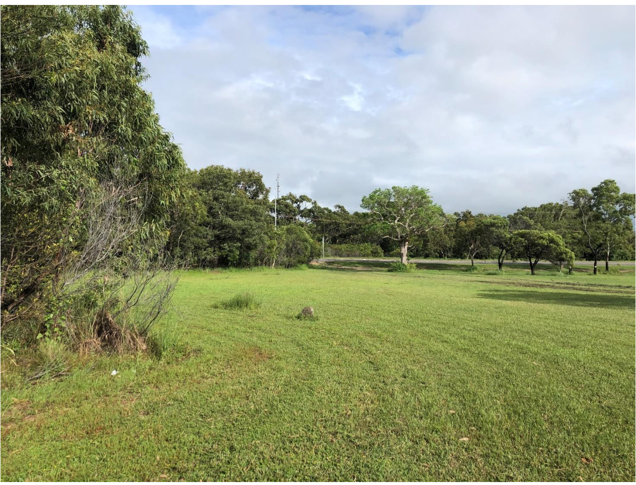
Figure 1 Road Frontage to Hope St